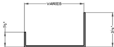
HILTI MODIFIED J-BAR