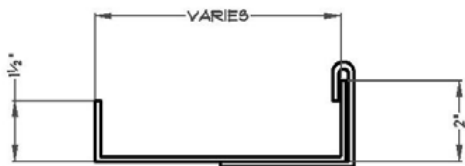
J-BAR & EXP. CLIP